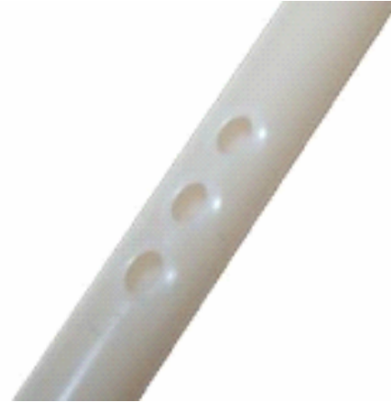
Bur free precision cuttings

Send us your catheter with requirements – we offer to you a suitable machine.