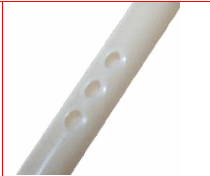
Bur free precision cutting