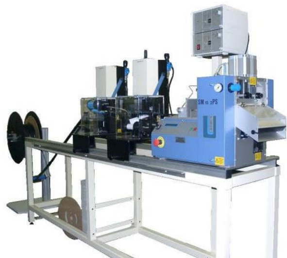
Marking- and cutting station for cables and tubes