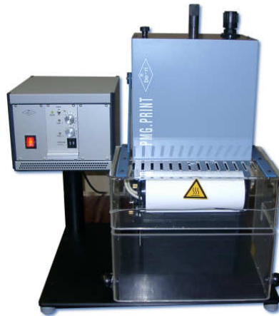
Above image shows a special version of the PMG for printing a continuous line of 180 mm length

In combination with as example as cutting devices the PMG.PRINT.50 also can